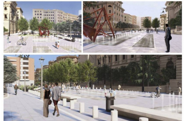
Vista di dettaglio area centrale