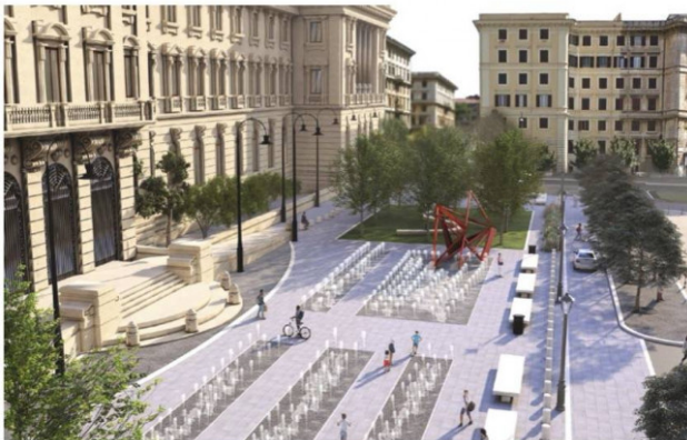
Vista area centrale fronte ex Poligrafico