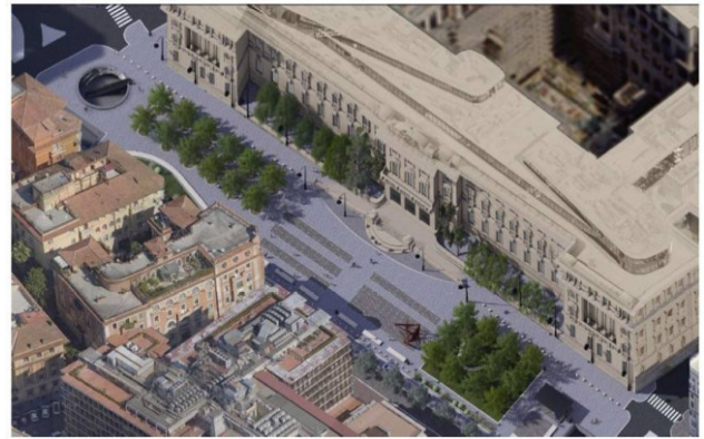
Vista Asonometrica complessiva