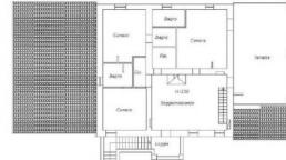
PIANTA PIANO PRIMO