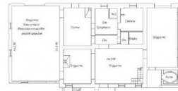
PIANTA PIANO TERRA