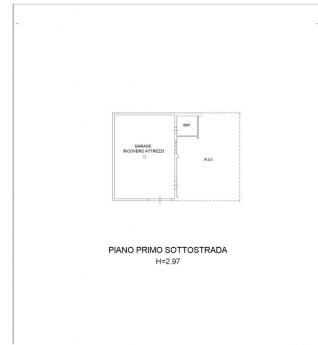
PIANO PRIMO SOTTOSTRADA H=2.97